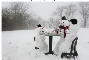
New owners enjoying the lovely lawn below Maplewood during the February 2021 winter storm